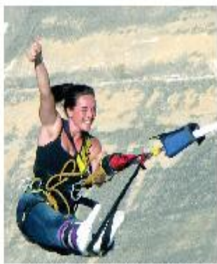
BUNGEE JUMPING from Versaca Dam, Locarno Switzerland.

at 1 pm on August 19. Yes, there will be plenty of time to lounge in elegant, evening attire sipping martinis, "shaken, not stirred." It's the only way Theme Party People know how to do it.